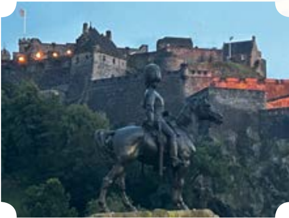
(Edinburgh, Scotland 2023)